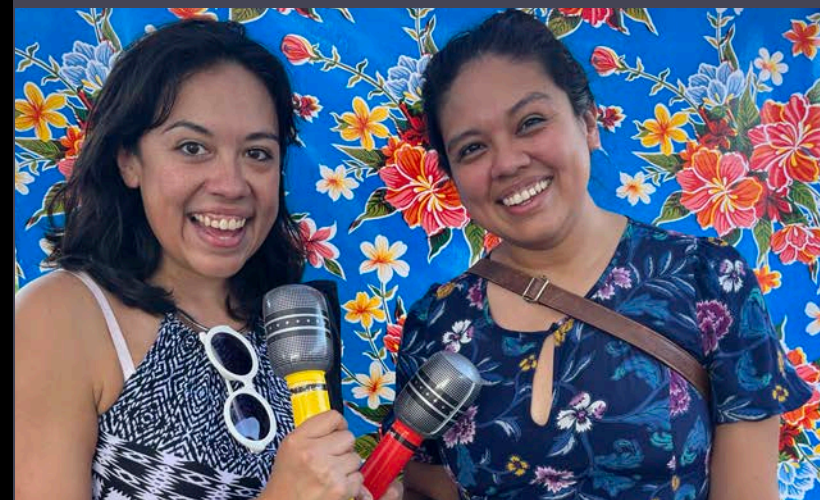
Collecting Oral Histories from the Community