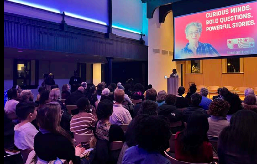
Free Public Humanities Events