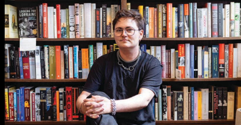
Independent Practitioner Fellow