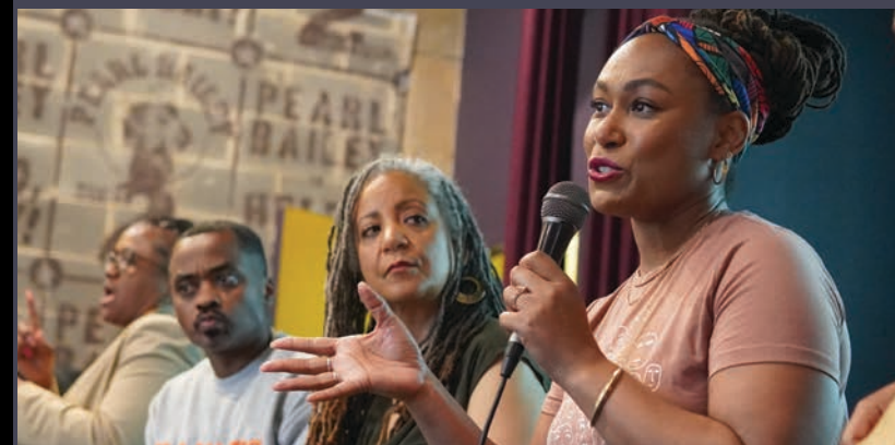
Culture Series panel on Black Literature in DC

We connect curious people with bold questions to the powerful stories of our vibrant city. Through our programs we help build a community where all can engage in conversation, reflect on our connected stories and celebrate our various cultures.